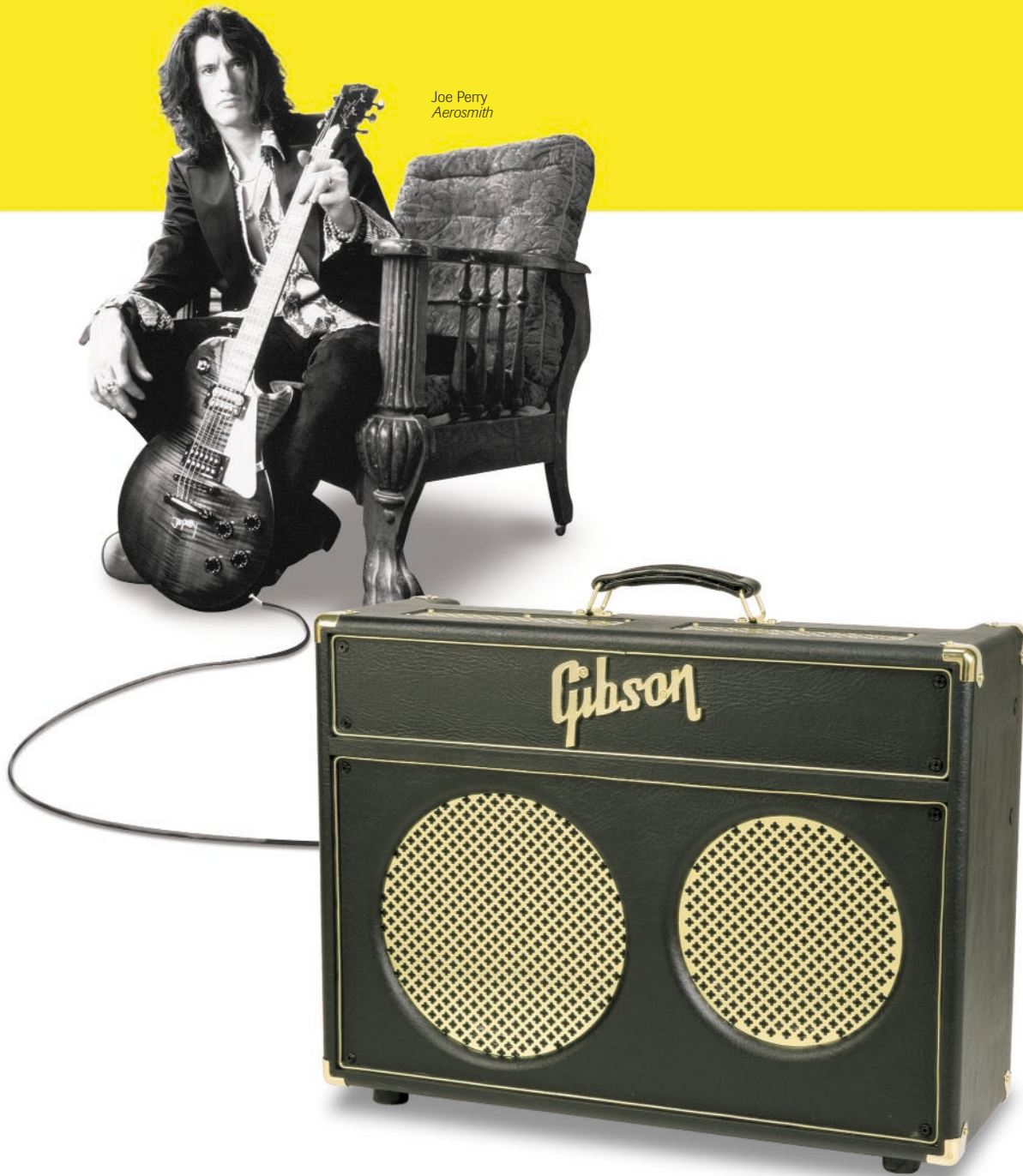
Joe Perry Aerosmith